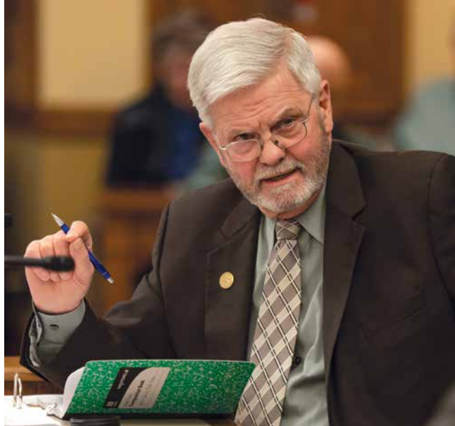
Senate Minority Caucus Chair Mark Miller asks a question at a meeting of the Speaker's Task Force on Water Quality. The task force was created in the wake of reports about the contamination of private wells in southwest Wisconsin. Such task forces study specific issues and make recommendations on policy to address those issues.

Scheduling. A bill that reaches a scheduling committee cannot advance further unless the scheduling committee schedules it for a meeting of the house or the house acts to withdraw it. The scheduling committee is not required to schedule the bill for a meeting of the house. If the house withdraws a bill from the scheduling committee, the bill is automatically scheduled for a future meeting of the house. (In the senate, it is placed on the calendar for the senate's next suc-