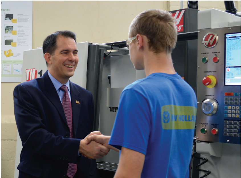
DEPARTMENT OF WORKFORCE DEVELOPMENT