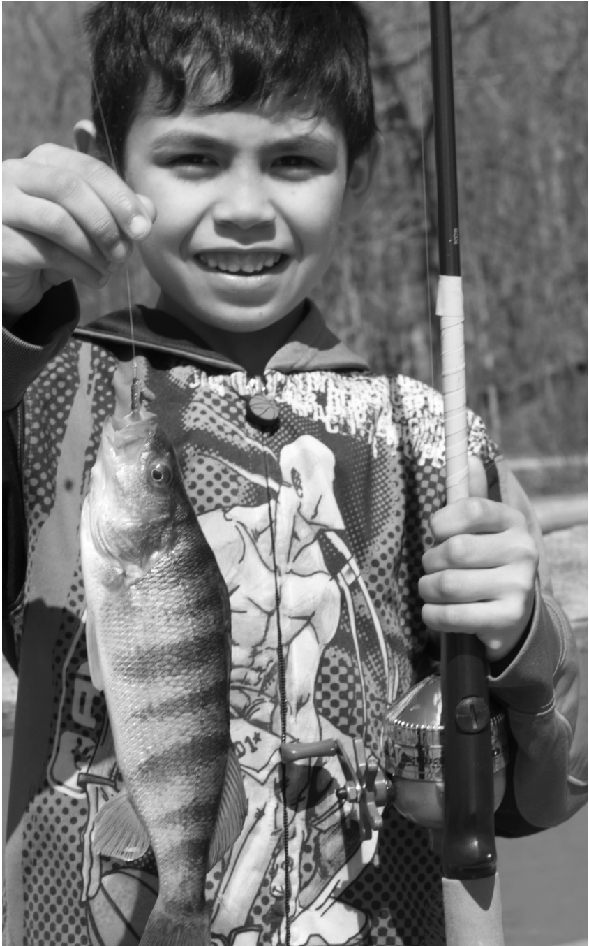
DEPARTMENT OF NATURAL RESOURCES

Putting on kids fishing clinics is one of the many ways the Department of Natural Resources works with local organizations to build an appreciation for the state's natural resources.