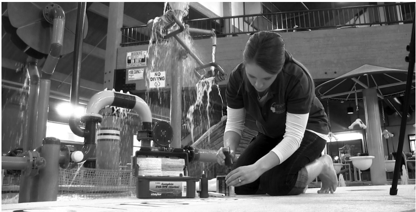
(top) An entomologist with the Department of Agriculture, Trade and Consumer Protection checks a trap for agricultural pests as part of the department's growing season survey that helps farmers with pest control. (above) An inspector for the Division of Food and Recreational Safety tests water samples to be sure a water park is safe.

and is administered by a secretary. The members of the board and the secretary are appointed by the governor with the advice and consent of the senate.