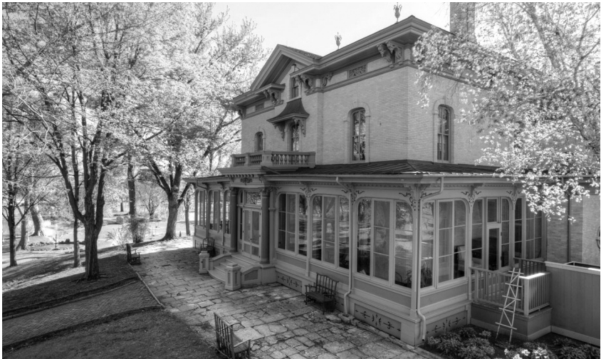
STATE HISTORICAL SOCIETY OF WISCONSIN

Villa Louis in Prairie du Chien is one of several historic sites operated by the State Historical Society of Wisconsin. The estate was established by the Dousman family in the 1840s and rebuilt in the 1870s in the Italian Villa style.