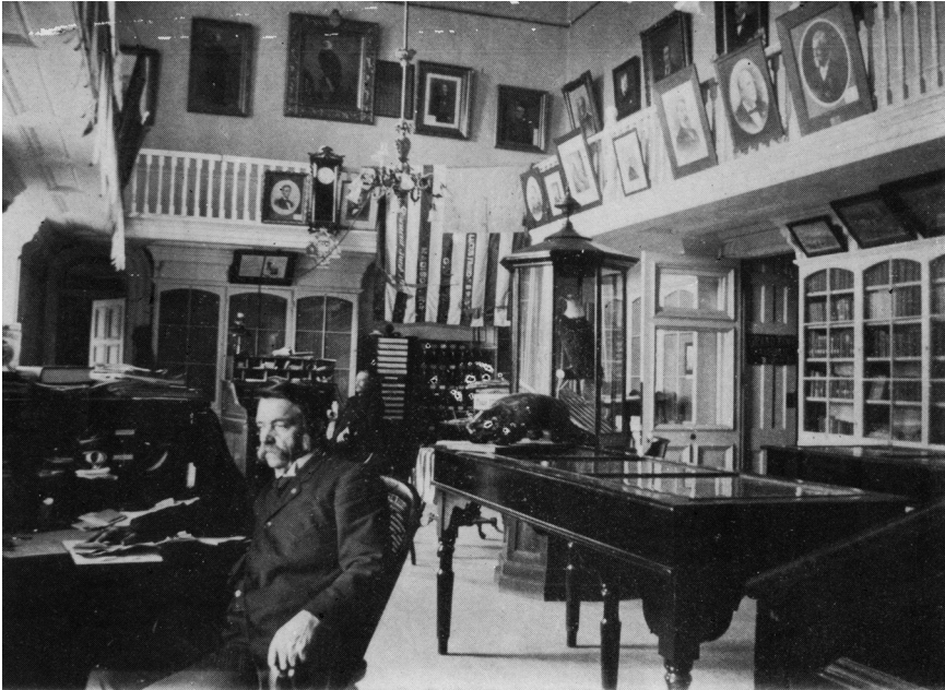
(Wisconsin Veterans Museum)