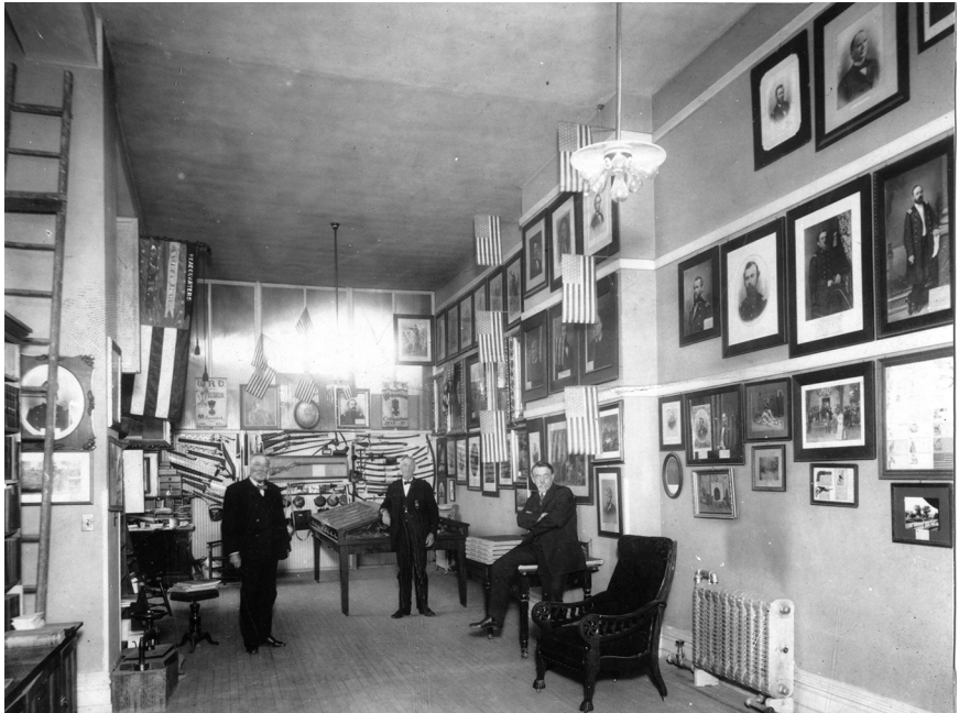
GAR Memorial Hall, Madison.