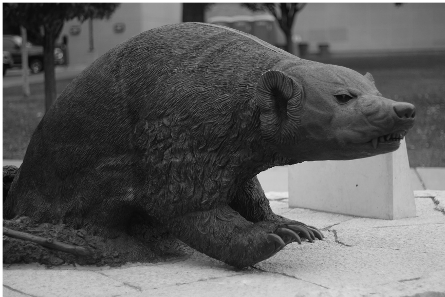
The badger, known for its fierce tenacity, has been an emblem of Wisconsin from the earliest days of settlement.