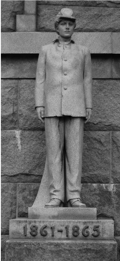
The silent sentries have stood guard at the Camp Randall arch for over a century. (Sarah Girkin)

Heavy immigration continued after statehood. The state remained largely agricultural with wheat the primary crop. Slavery, banking laws, and temperance were the major issues of the period. Despite the number of for-