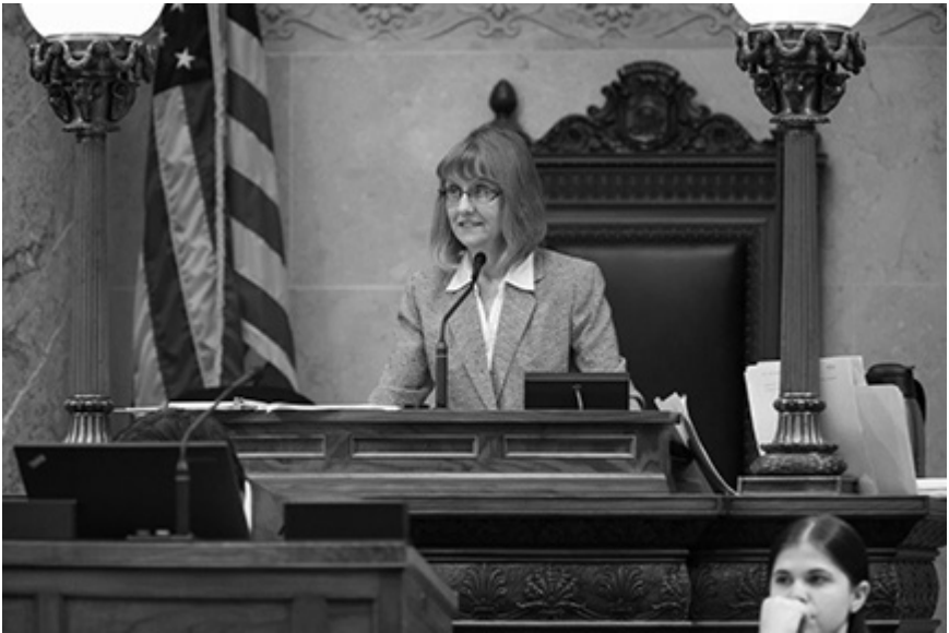
Senator Mary Lazich, President of the Senate, the first woman to be elected presiding officer in either house of the legislature.

2015 — Senator Mary Lazich was elected President of the Senate, the first woman to be elected presiding officer of either house of the legislature. Efforts to open an iron mine in the Gogebic Range were abandoned. The legislature enacted "Right to Work" legislation. The voters approved a constitutional amendment requiring the supreme court to elect its chief justice by majority vote. The legislature raised the speed limit to 70 mph on certain highways.