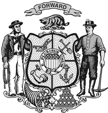
The Coat of Arms

Over the years, the Wisconsin Legislature has officially recognized a wide variety of state symbols. In order of adoption, Wisconsin has designated an official seal, coat of arms, motto, flag, song, flower, bird, tree, fish, state animal, wildlife animal, domestic animal, mineral, rock, symbol of peace, insect, soil, fossil, dog, beverage, grain, dance, ballad, waltz, fruit, tartan, and pastry. (The “Badger State” nickname, however, remains unofficial.) These symbols provide a focus for expanding public awareness of Wisconsin’s history and diversity. They are listed and described in Section 1.10 of the Wisconsin Statutes.