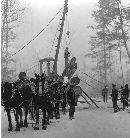
Loading logs near Mosinee, 1914.

Heavy machinery manufacturing, paper products and dairying consolidated their position as the leading economic activities. As the last virgin forests in the northern half of the state were cut over, lumbering faded in importance. Brewing temporarily disappeared with the advent of Prohibition.