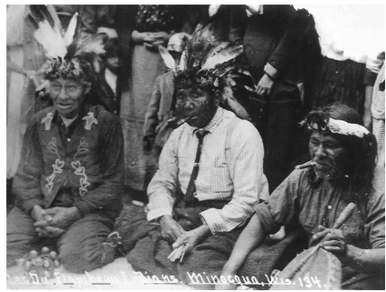
Indian gaming at Lac du Flambeau, c. 1911.