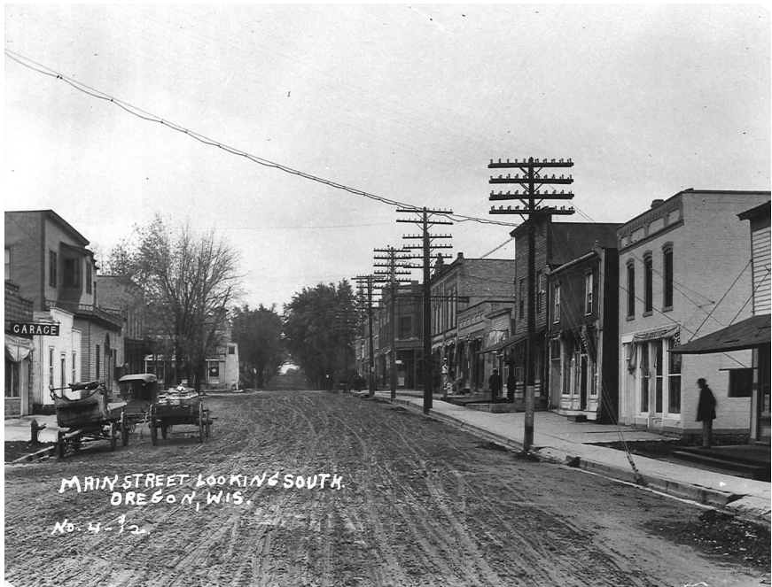
Main Street, Oregon, 1912. (State Historical Society, 38978)

1984 — Most powerful U.S. tornado of 1984 destroyed Barneveld; 9 dead. Democratic