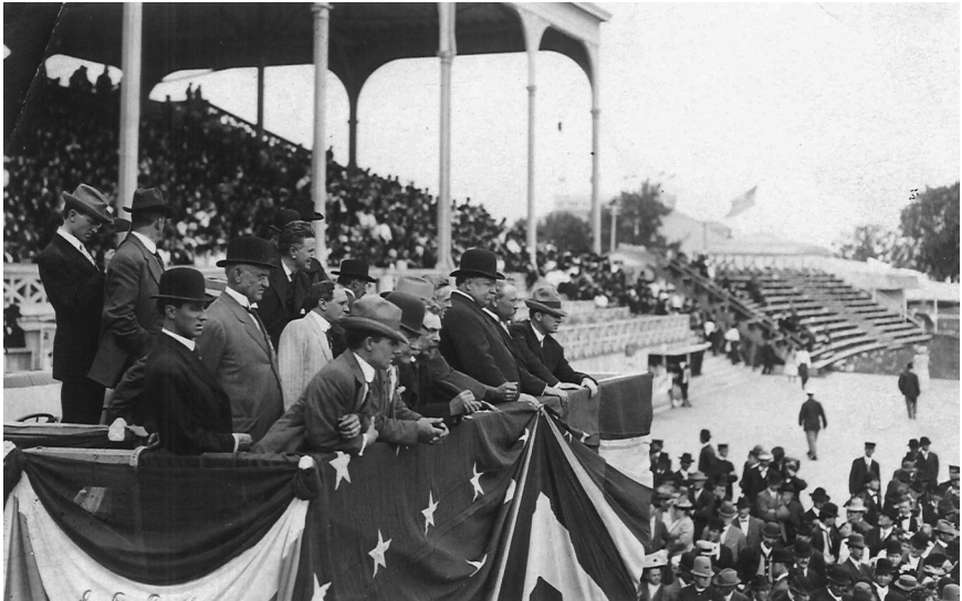
President William Howard Taft at the Wisconsin State Fair, 1909.

After the Civil War Wisconsin matured into a modern political and economic entity. Heavy immigration continued throughout the period. The mix of immigrants remained similar to that prior to the Civil War until the end of the century, when Poles began to appear in large numbers.