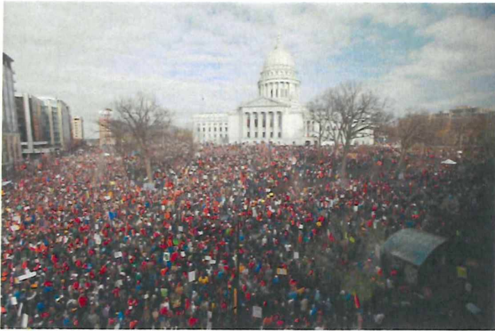
Crowds continued to protest restrictions on collective bargaining for public employees at the Wisconsin State Capitol in Madison on March 12, 2011.

Not only does this bill encourage overzealous policing of protected protest activity, but the statute creates a civil cause of action, a hammer to wield against not just someone who might have painted a slogan on a wall, but also against anyone who might be in that net of “encouragers.” This civil remedy includes not just the costs of repairing property, but additional compensatory damages, plus emotional distress, plus attorney’s fees.