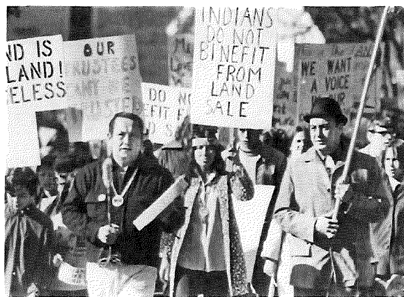
In 1972, hundreds marched from Keshena, Wisconsin to Madison to protest the sale of Menominee land despite treaty restrictions.

This bill criminalizes what it calls "riots" – but the definition of a riot is far from the image of a riot involving looting and burning and chaos that you might have in your minds. The definition of riot requires only three people in a group, only one of whom engages in a violent action to damage property. In other words, 3 children together and one decides to throw a rock on a dare from the others which breaks a window, is a riot under the definition of the statute. But the statute, goes even further – a threat to riot is a crime, "I dare you to throw that rock" – even if the rock is never thrown. And then it goes further yet to make "inciting" that dare a crime – inciting is "urge, promote, organize, encourage, or instigate other persons."