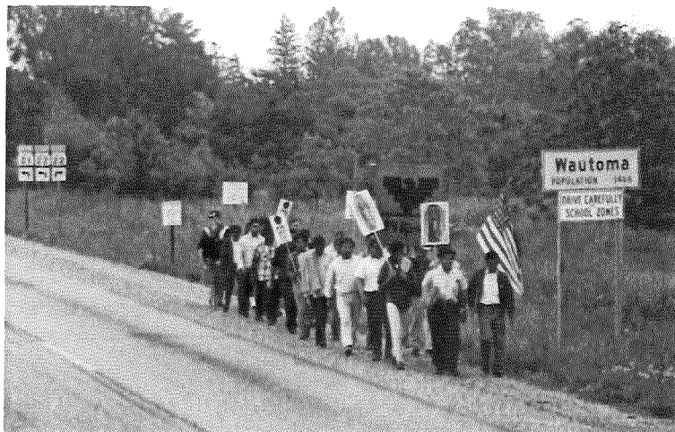
In August 1966, two dozen migrant farm workers, mostly Mexican marched from Wautoma, Wisconsin to the Capitol in Madison to draw attention to their demands for a minimum wage for agricultural workers of $1.25 per hour, improved housing, public bathrooms for workers, and a meeting with the Governor's Committee on Migratory Labor.

Although the co-sponsorship memo states this bill about paying for destruction caused by violent riots, the real effect of this bill is to chill vigorous speech, especially in public protests. If AB-88 were enacted, most reasonable, law-abiding Americans may well think twice before joining a protest, rally, or demonstration. In an era of historic activism, that response isn't just unconstitutional, it's fundamentally un-American.