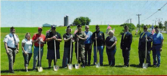
Memorial Groundbreaking 6/14/2020.

"Your entire group deserves credit for such a well-organized, efficiently run fundraiser. Before even asking for a nickel, a dream evolved into a concept and then a plan spelling out exactly what needed to be done, in what order, and by whom. Obstacles were met head on and solved. Those tasked with meeting potential donors did so with respect, humility, and appreciation. Those tasked with promoting and cooking for the wonderful steak feeds did so with smiles, all while keeping their eye on the mission to build a beautiful memorial in honor of all veterans, near and far. Yes, you've come a long way...all because of the determination to make the dream become a reality, and it did!"