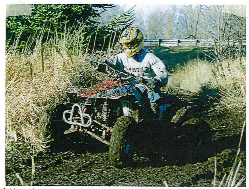
A blast from the past! The former Knobby Tires 4H Club focused its efforts on promoting safe, fun and responsible riding practices for youth members. Photo from 2003. Youth members from this club have grown up and now have kids of their own that enjoy riding.