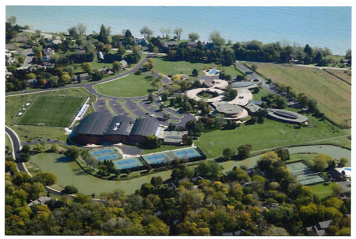
The Prairie School