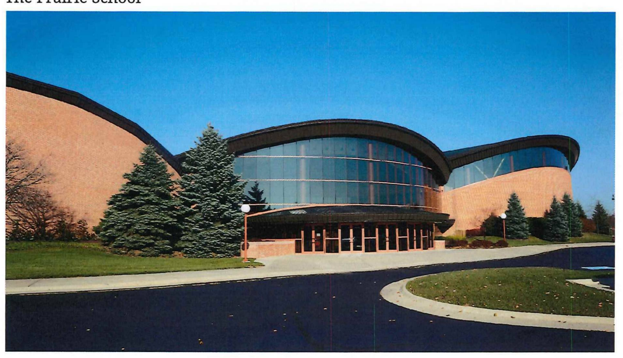
Johnson Athletic Center