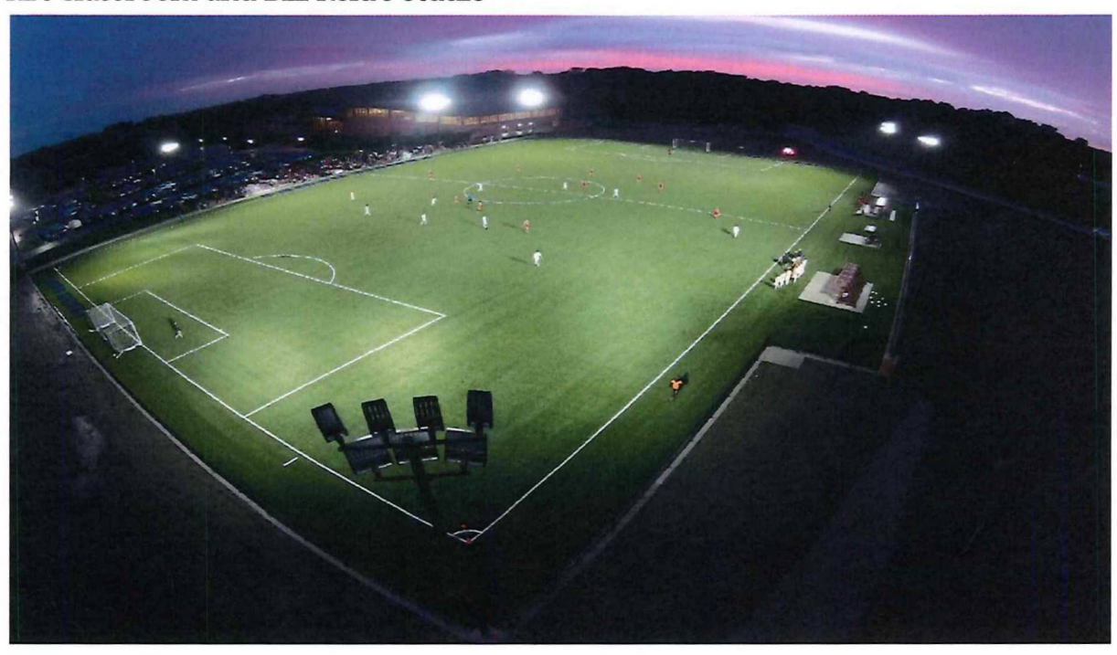
Ruud Family Soccer Complex