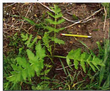
Rosette of leaves.

Non-flowering rosettes. Germinating seeds produce low-growing non-flowering rosettes of leaves the first year. Each rosette is a cluster of spindly, compound leaves that resemble celery leaves.