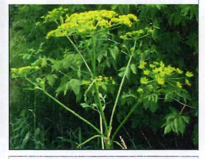
Primary and secondary umbels.

Flowers. The flowers are tiny, five-petaled and yellow-green, borne in umbels (flat clusters) atop four- to five-foot-tall leafy stems. Stems are stout, grooved and hollow. Most flowering occurs from early June to mid-July. Umbels are two to six inches across. Primary umbels, the largest, bloom first atop the main stem, followed by secondary and tertiary umbels, blooming 10-14 days later on side branches. With different bloom times, plants can produce seed for a longer period than if all the flowers matured at once. This gives plants a competitive advantage. When flowering ends, plants start to wither and die.