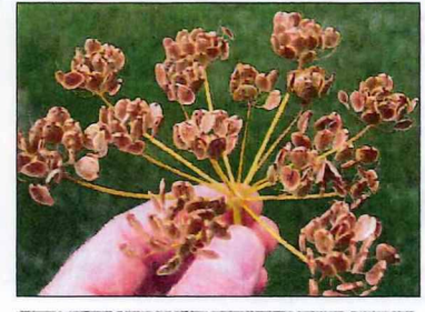
Wild parsnip seeds.

Seeds. Wild parsnip seeds are oval, onequarter-inch long and smooth on one side with four horizontal curved "ribs" on the other. They mature in about three weeks, changing from yellow-green to tan in color. Most seeds fall by October in southern Wisconsin. About 1,000 seeds are produced per plant. They require a cold period to germinate, so most sprout in spring. Seeds are viable for about four years.