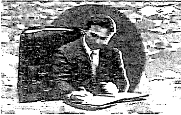
Gov. Ron DeSantis

It aims to incentivize developers of affordable, workforce housing with tax breaks, zoning workarounds