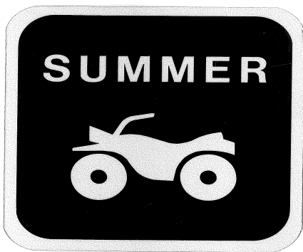
YEAR ROUND USE TRAIL MARKER