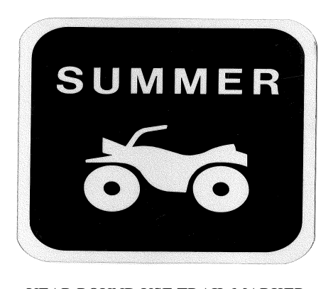
YEAR ROUND USE TRAIL MARKER