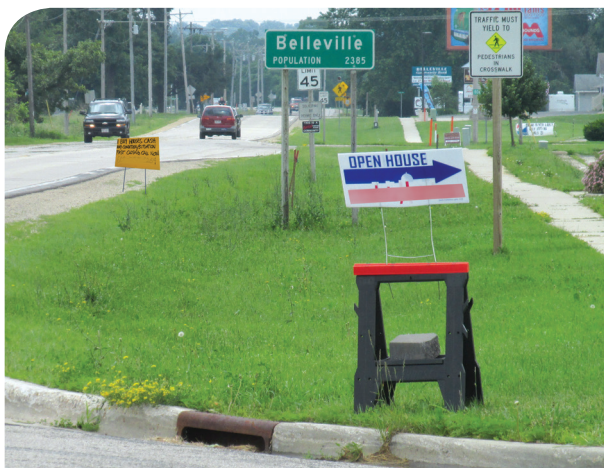
Signs placed improperly within the right-of-way may be a hazard.

For the safety of everyone, it is the duty of state and county workers to remove improperly placed signs. These workers are trained to handle such work activities safely.