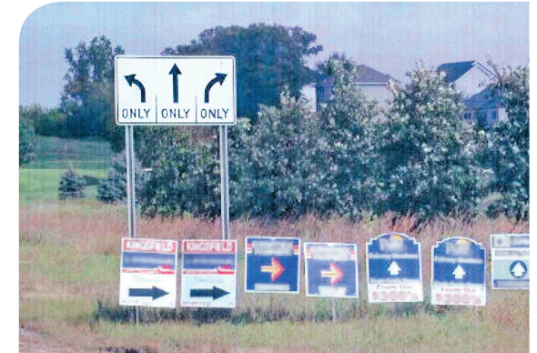
Improperly placed signs may add to the clutter along the roadside and be confusing to motorists.

If a sign is removed by a public employee, you may call your county highway department to get it back – if the sign was removed less than 30 days ago. To retrieve the sign, you will need to pick it up at the county highway office or shop.