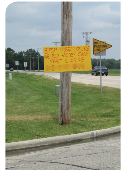
Signs may block motorists' vision, causing unsafe conditions.