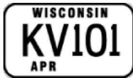
Plate size was changed in 2003. Both styles are valid if currently registered.