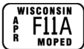
Plate size was changed in 2003. Both styles are valid if currently registered.