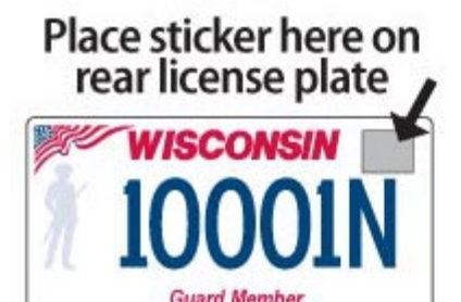
Decal dimensions: 1.5 in wide by 1.25 in high

Questions? Contact us: Wisconsin DMV email service