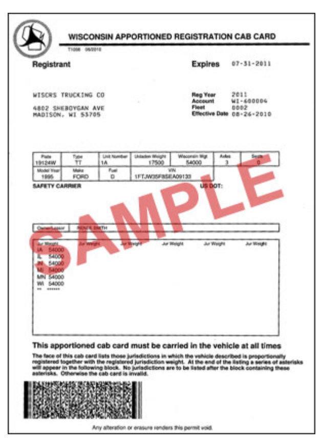
Apportioned cab card (click to enlarge)

Motor carriers from other IRP jurisdictions are also issued apportioned cab cards which contain similar information. Interstate and intrastate operation in Wisconsin is authorized by notation of "Wisconsin" and the weight for which the vehicle is registered in Wisconsin.