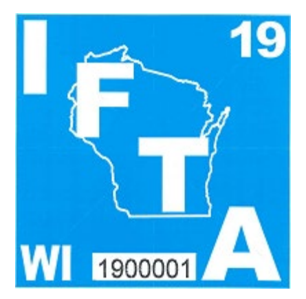
2019 IFTA sticker

The IFTA license offers several benefits to the interstate/interjurisdictional motor carrier. These benefits include one license, one set of decals per vehicle, and one quarterly fuel tax report per licensee that reflects the net tax or refund due. These advantages result in cost and time savings for the carrier and the member jurisdictions.