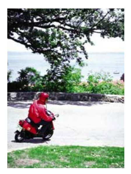
Moped driver by the lake

The moped dealer license allows a business to sell, offer to sell, negotiate the sale or lease with an option to buy mopeds only. "Moped" means any of the following motor vehicles capable of