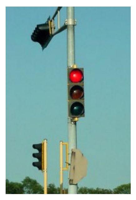
Running a red light is no joke

You can turn left on red if you are turning from a one-way to a one-way street. You must stop first and yield the right of way to all pedestrians, bicyclists and other vehicles using the intersection.