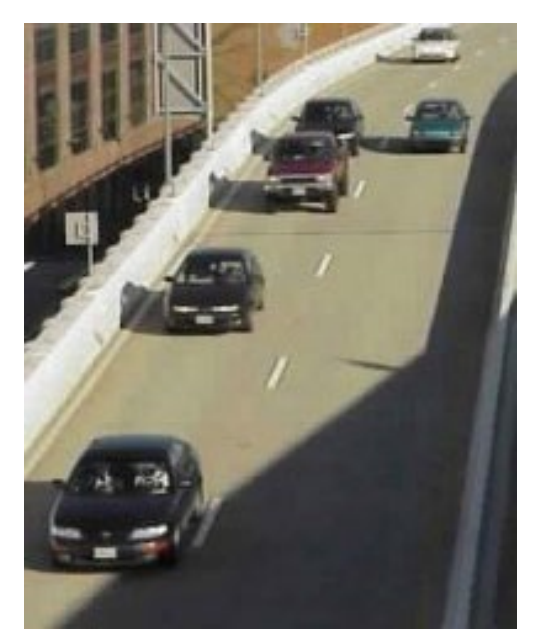
Nobody likes a tailgater

• Anticipate hazardous situations that could cause the driver in front of you to slow or stop suddenly.