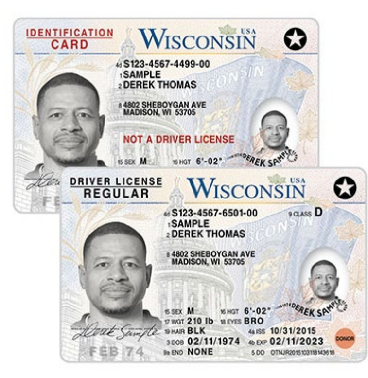
Sample cards starting Fall 2015