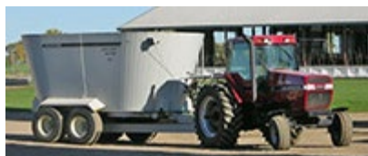
Example of IoH Category C

c. A farm wagon, grain cart, farm trailer, manure trailer, or trailer adapted to be towed by, or to tow or pull, another implement of husbandry (referred to as Category C).