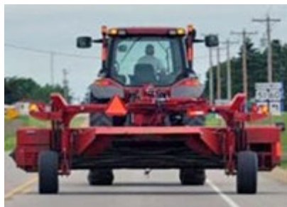
Example of Category B -