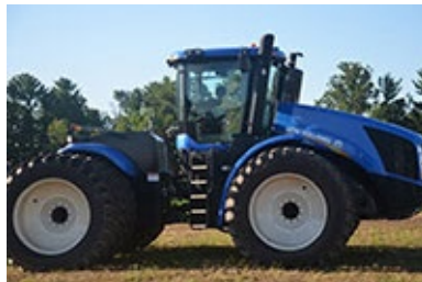
Example of IoH Category A

b. A self-propelled combine; a self-propelled forage harvester; self-propelled fertilizer or pesticide application equipment but not including manure application equipment; towed or attached tillage, planting, harvesting, and cultivation equipment and its towing farm tractor or other power unit or farm tractor or other power unit to which it is attached; or another self-propelled vehicle that directly engages in harvesting farm products, directly applies fertilizer, spray, or seeds but not manure, or distributes feed to livestock (referred to as Category B).