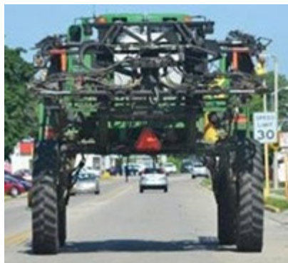
Example of Category B