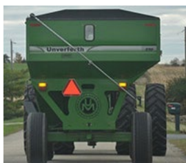
Example of IoH Category C

2. A combination of vehicles in which each vehicle in the vehicle combination is an implement of husbandry as described above or in which an IoH Category C is towed by a farm truck, farm truck tractor, motor truck or agricultural commercial motor vehicle.