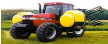
Example of Category B