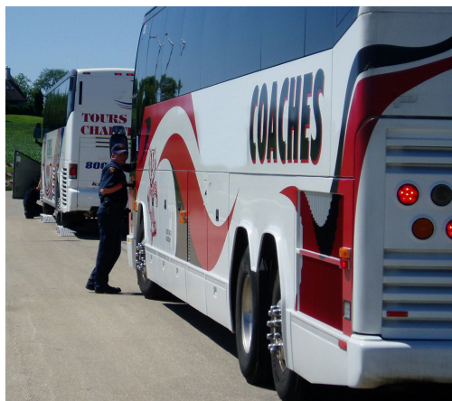
Motor bus about to be inspected

operated by an urban mass transit system can be self-inspected, but the Department of Transportation must review and record the inspection report, and may perform an independent inspection of the motor bus. (See Wisconsin Administrative Code □ Trans 330 ).