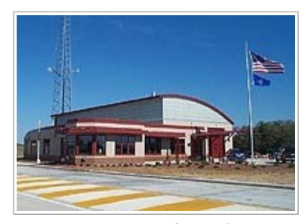
Wisconsin safety and weight enforcement building

Inspectors ensure that commercial carriers operate within statutory or permitted size and weight limitations. They check carriers to ensure they have proper registration, fuel tax, insurance and authority credentials. Enforcement activities occur at State Patrol safety and weight enforcement facilities as well as through mobile enforcement using portable scales.