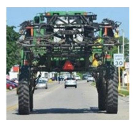
Example of Category B

c. A farm wagon, grain cart, farm trailer, manure trailer, or trailer adapted to be towed by, or to tow or pull, another implement of husbandry (referred to as Category C).