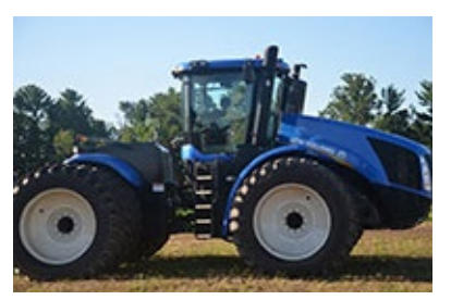
Example of IoH Category A

b. A self-propelled combine; a self-propelled forage harvester; self-propelled fertilizer or pesticide application equipment but not including manure application equipment; towed or attached tillage, planting, harvesting, and cultivation equipment and its towing farm tractor or other power unit or farm tractor or other power unit to which it is attached; or another self-propelled vehicle that directly engages in harvesting farm products, directly applies fertilizer, spray, or