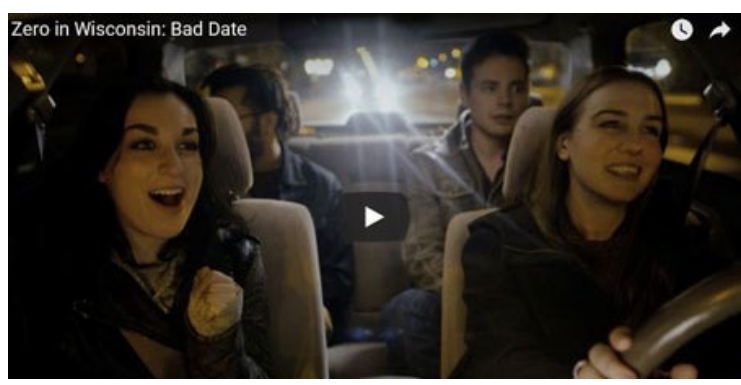
A Zero in Wisconsin ad titled Bad Date depicted the dangers of not wearing a seatbelt. According to the Centers for Disease Control and Prevention, compared with other age groups, teens have among the lowest rates of seat belt use. In 2015, only 61 percent of high school students reported they always wear seat belts when riding with someone else.

Last year, 5,175 teenagers were injured and 46 killed in vehicle crashes on Wisconsin roads. National Teen Driver Safety Week - October 15-21 – is a time to raise awareness about the factors that contribute to teen driver crashes and what can be done to prevent them.