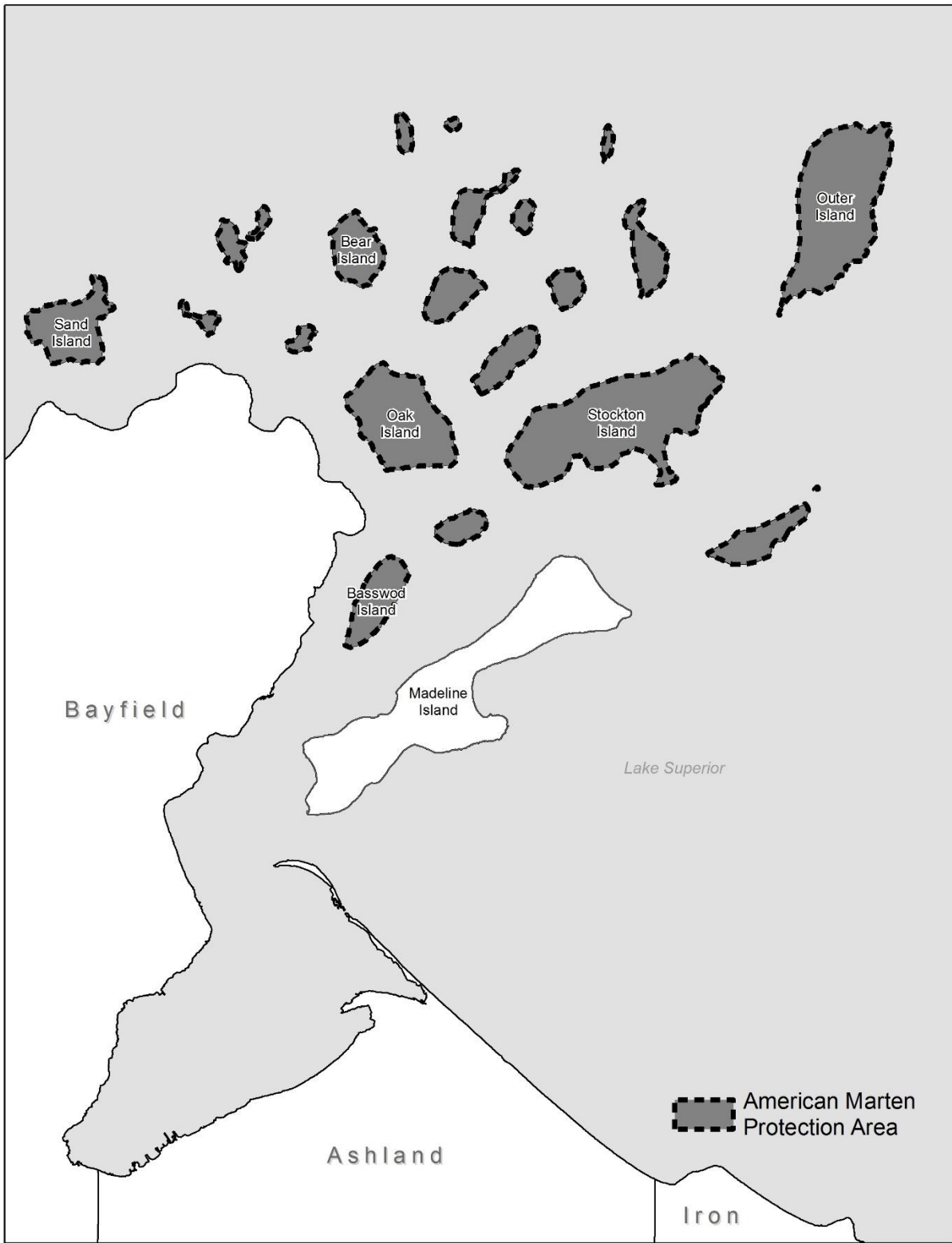
(c) Pine River Area (Forest, Oneida, and Vilas Counties)