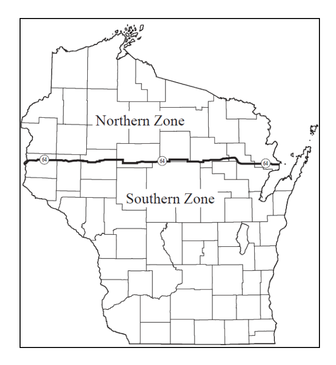
SECTION 15. NR 10.38 is created to read: