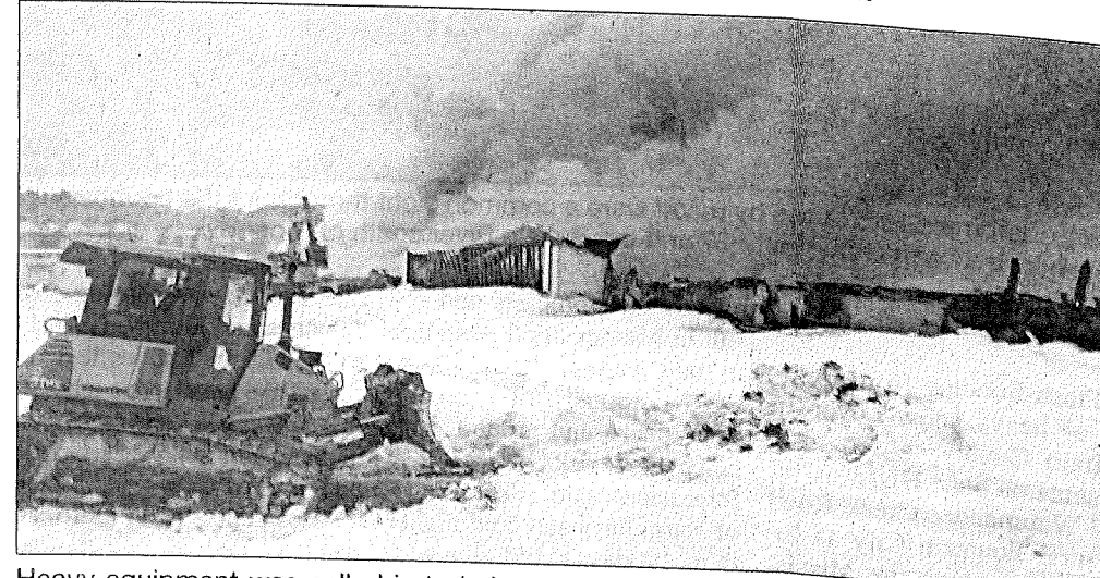
Heavy equipment was called in to help move deep snow to help firefighters gain bet access to the burning structure. - Courtesy of the Mondovi Fire Department

Fire trucks from multiple departments responded to last week's fire at Naples Sw tween Mondovi and Eleva. - Courtesy of the Mondovi Fire Department