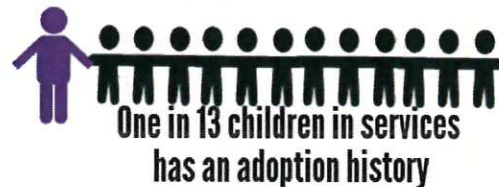
Based on WAFCA Survey 10/14

Agencies were asked to identify the number of children in their programs with a known adoption history. While a few agencies responded that they did not track this information, respondents identified 134 children in their programs who were adopted. Given the 1805 children in services identified in the sample this means one in thirteen children in services was adopted.