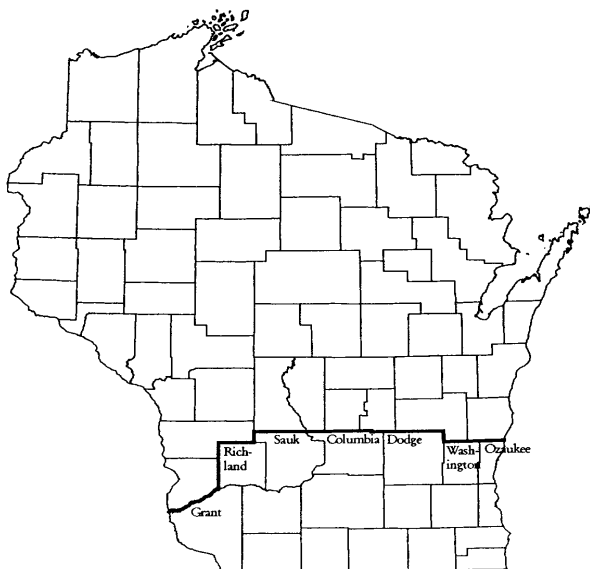
Alternate 4% g Contour Location

History: CR 00-179: cr. Register December 2001 No. 552, eff. 7-1-02.