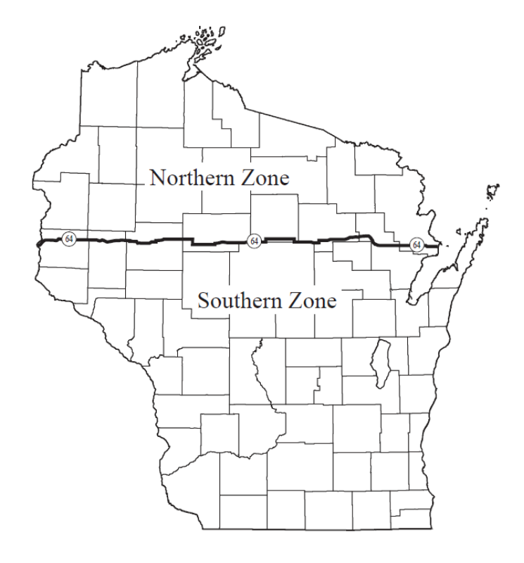
NR 10.34 Bobcat hunting and trapping zones.